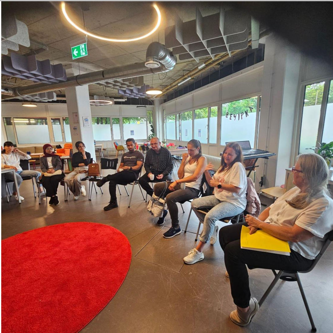
Day 3 (Utrecht)