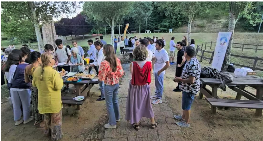
Day 4 (Siena)