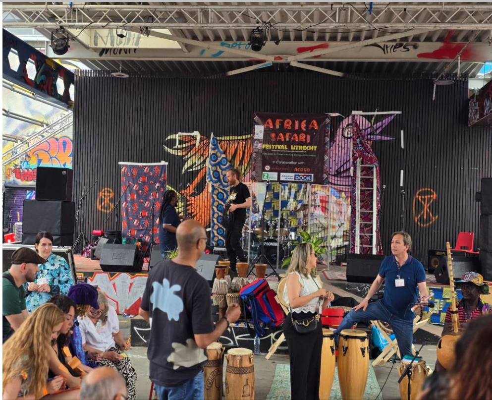
Day 1 (Utrecht)