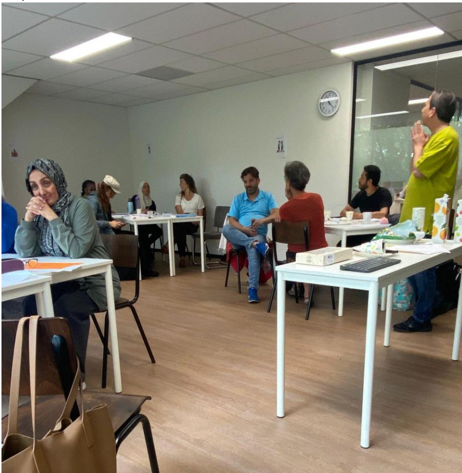
Day 5 (Utrecht)