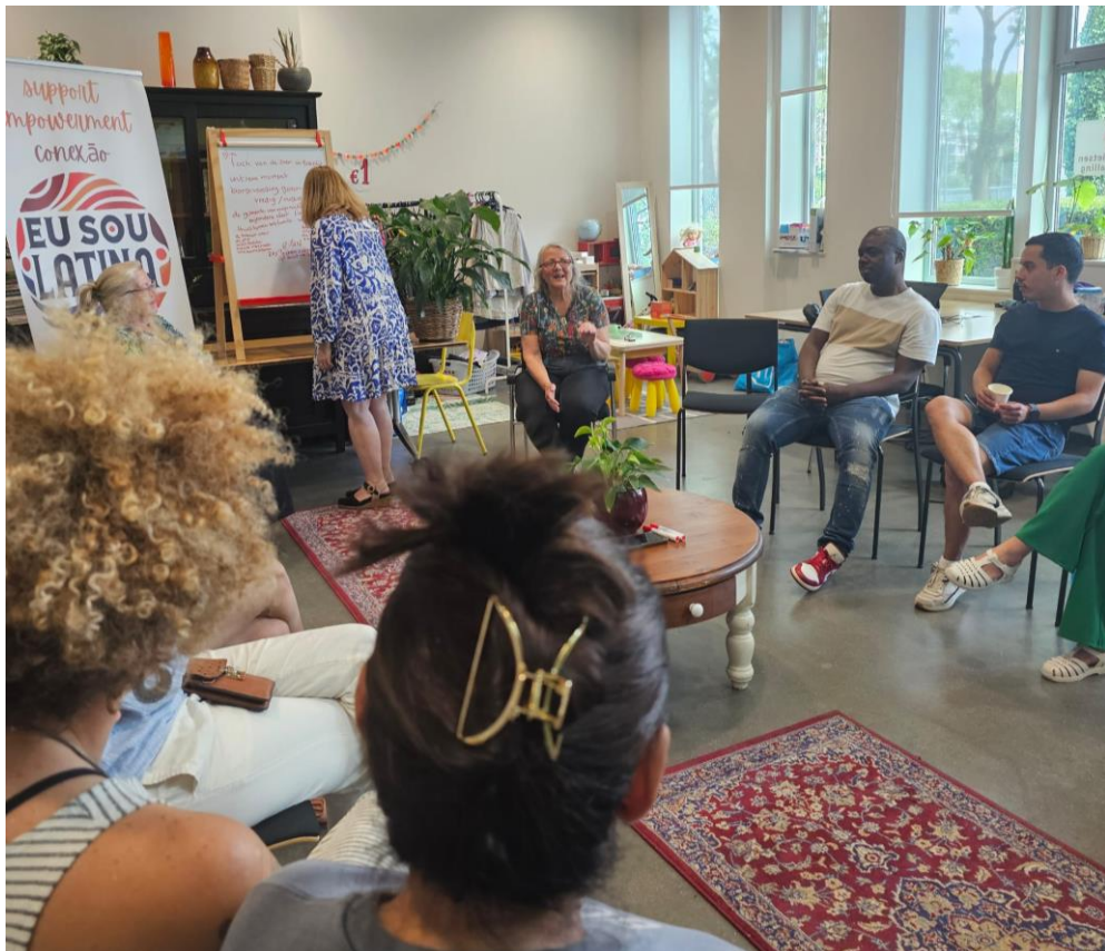
Day 2 (Utrecht)