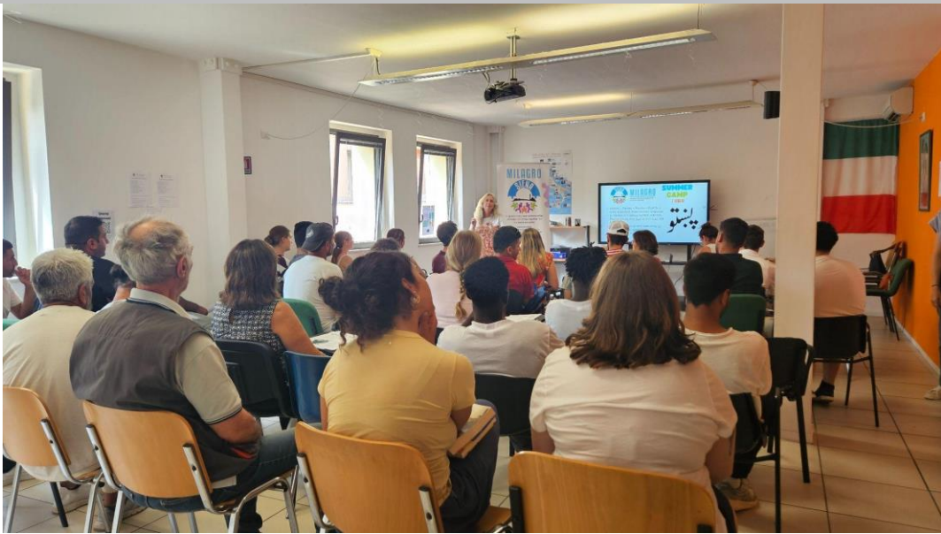
Day 1 (Siena)