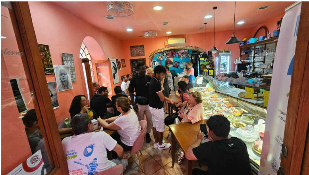
Day 2 (Siena)