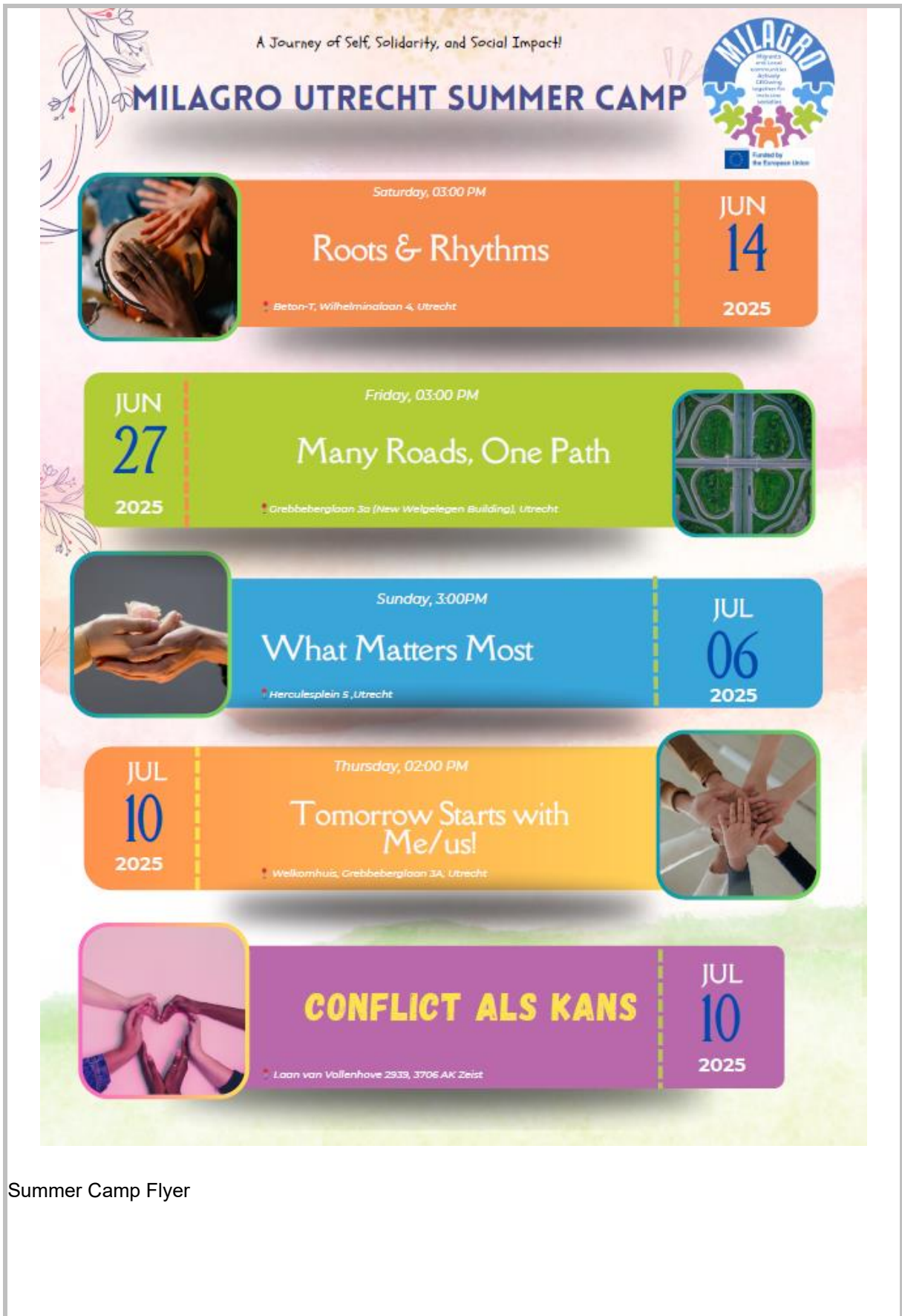
Summer Camp Flyer