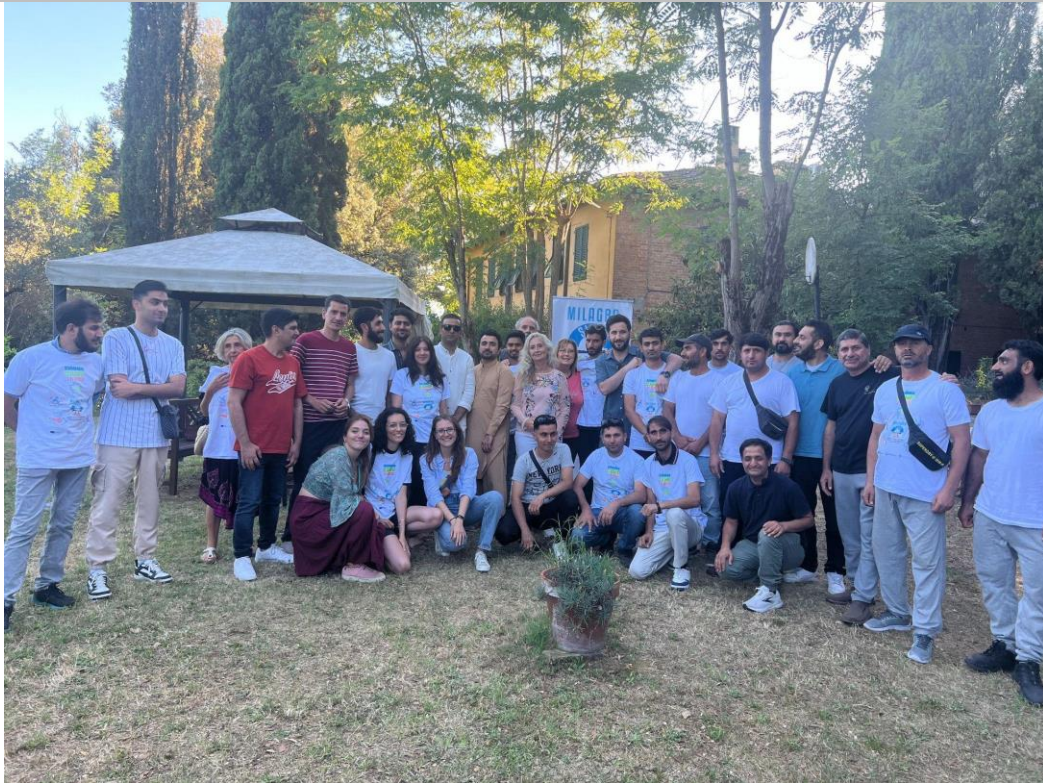
Day 3 (Siena)