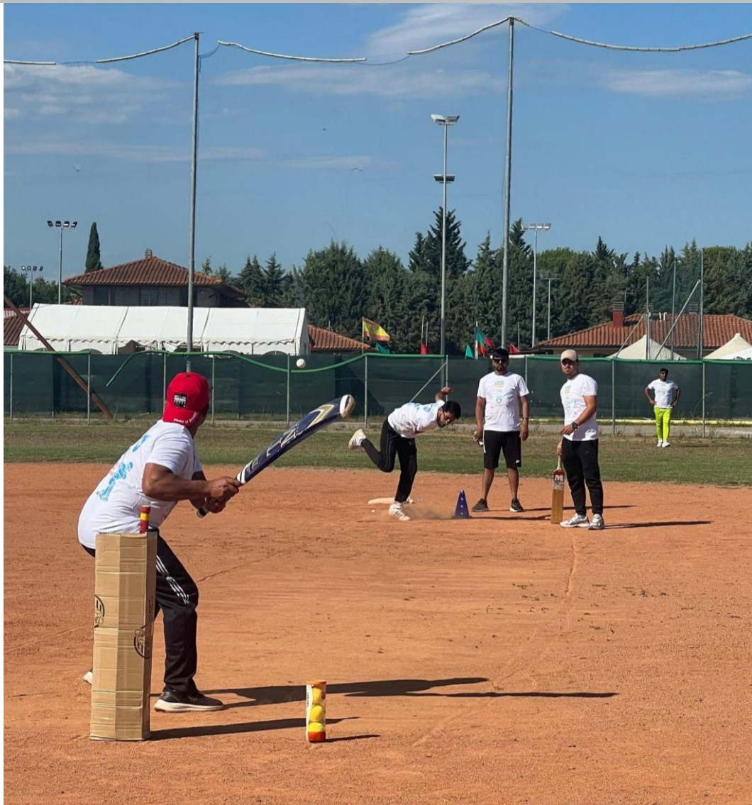
Day 5 (Siena)