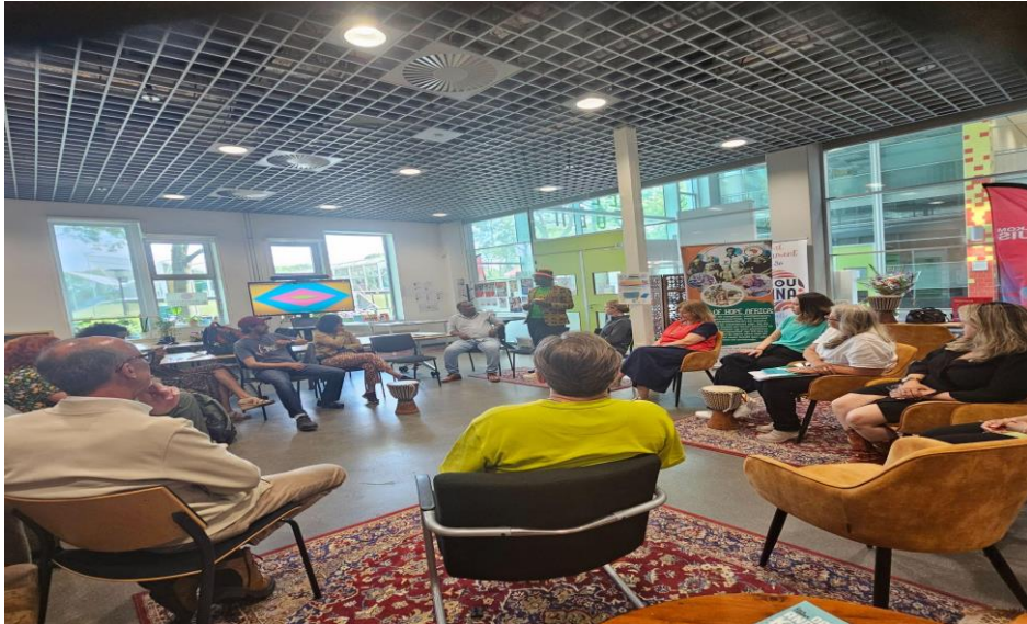
Day 4 (Utrecht)